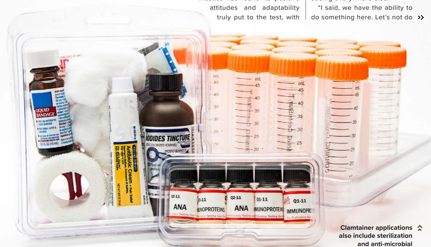
▲ Clamtainer applications also include sterilization and anti-microbial packaging.

Of course, in 2020 Jamestown Plastics has found its positive attitudes and adaptability truly put to the test, with