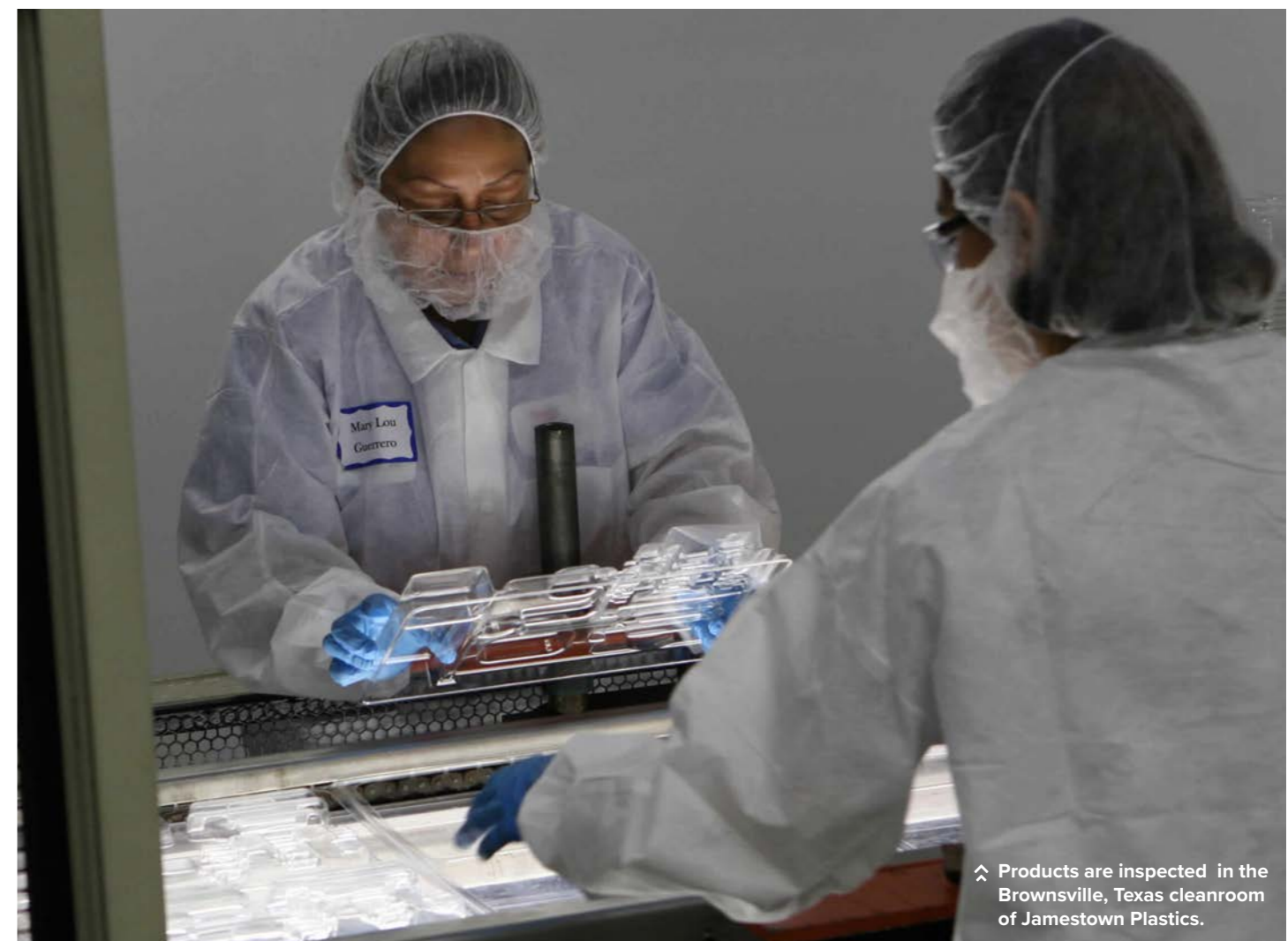
Products are inspected in the Brownsville, Texas cleanroom of Jamestown Plastics.

"I think there's going to be fundamental changes, post-COVID, in people's expectations of levels of protection. For example in the food industry, you see people preparing your food, the expectations about how people should be dressed," Baker points out. "There will be fundamental shifts and the product line we've developed won't be a one-time thing. Volume may drop, but we're in this for the long run." ☺